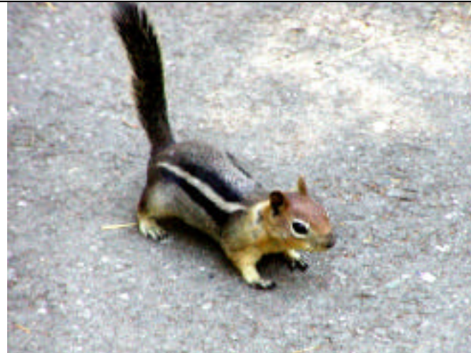
Of course, our little friends were all over the place.