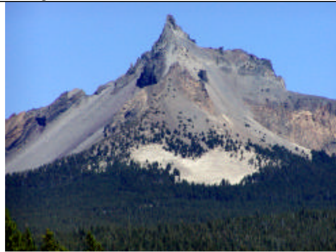
Mount Theilsen is much older. Ice, wind, and water has eroded much of the original mountain.