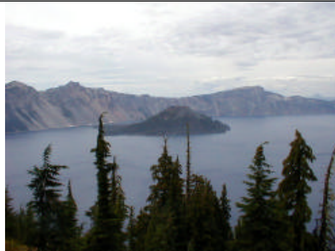
Wizard Island has almost a mysterious look to it.