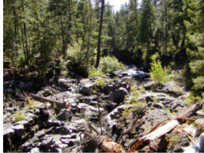
While the River flows through a lava tube, a natural bridge is left on the surface.