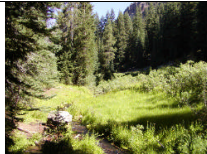
A few days later, a hike on the Castle Crest Wildflower Trail brought us to some beautiful meadows.