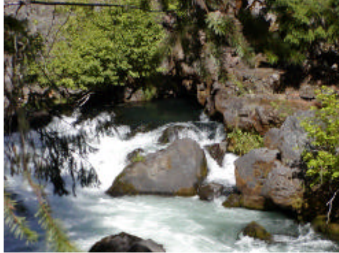
The Rogue River actually disappears underground.