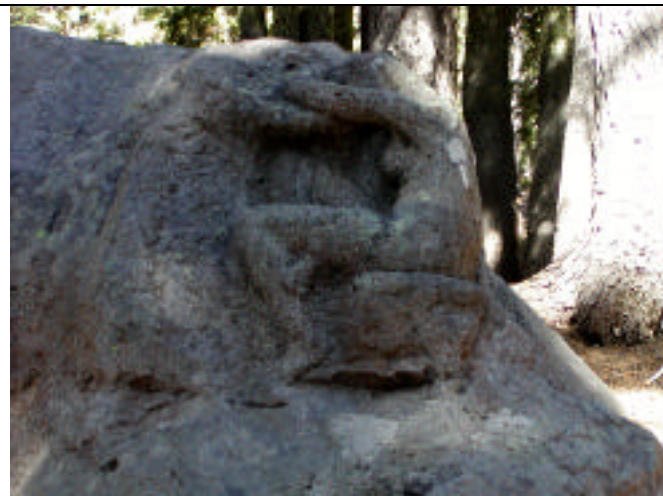
Lady of the Woods is a sculpture carved in a rock.