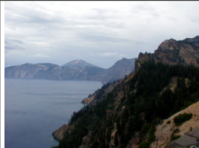
Crater Lake has many moods. On this day the overcast weather and lack of sun changed the color of the lake to gray.