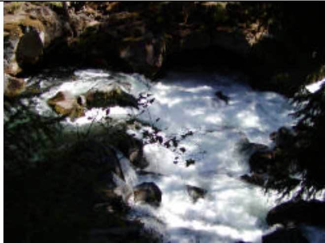
After a short distance, the river reaches the surface again.