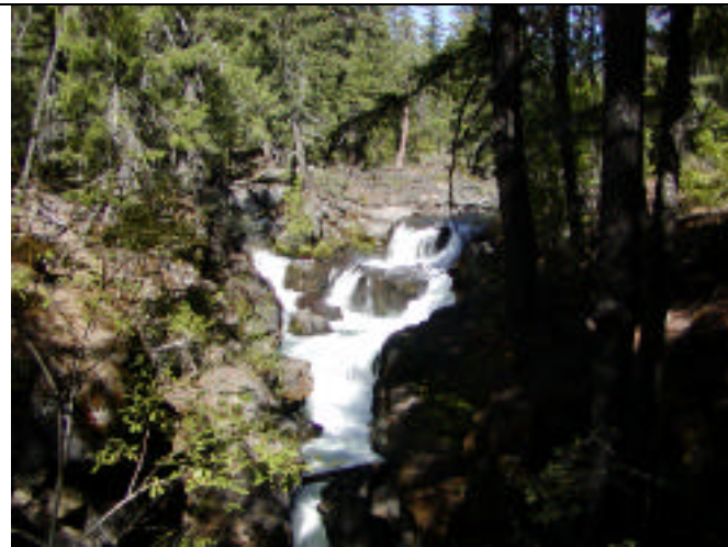
There are waterfalls in the Gorge.