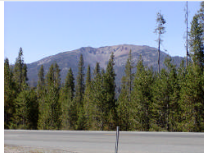
Mount Bailey is an extinct volcano that escaped carving by glaciers during the last ice age.